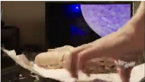
Health - Losing Weight on the Hunger Scale